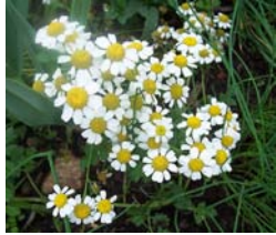
Chamomile ( Matricaria recutita )