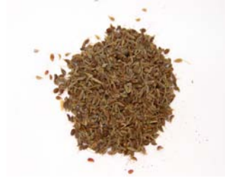
Anise ( Pimpinella anisum )