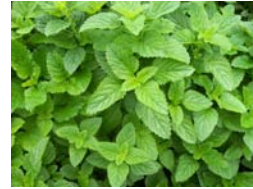
Lemon Balm ( Melissa officinalis )