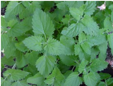
Catnip ( Nepeta cataria )