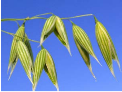
Oats ( Avena sativa )