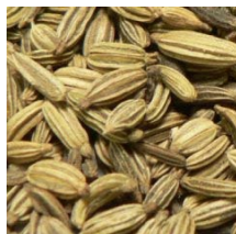
Fennel ( Foeniculum vulgare )